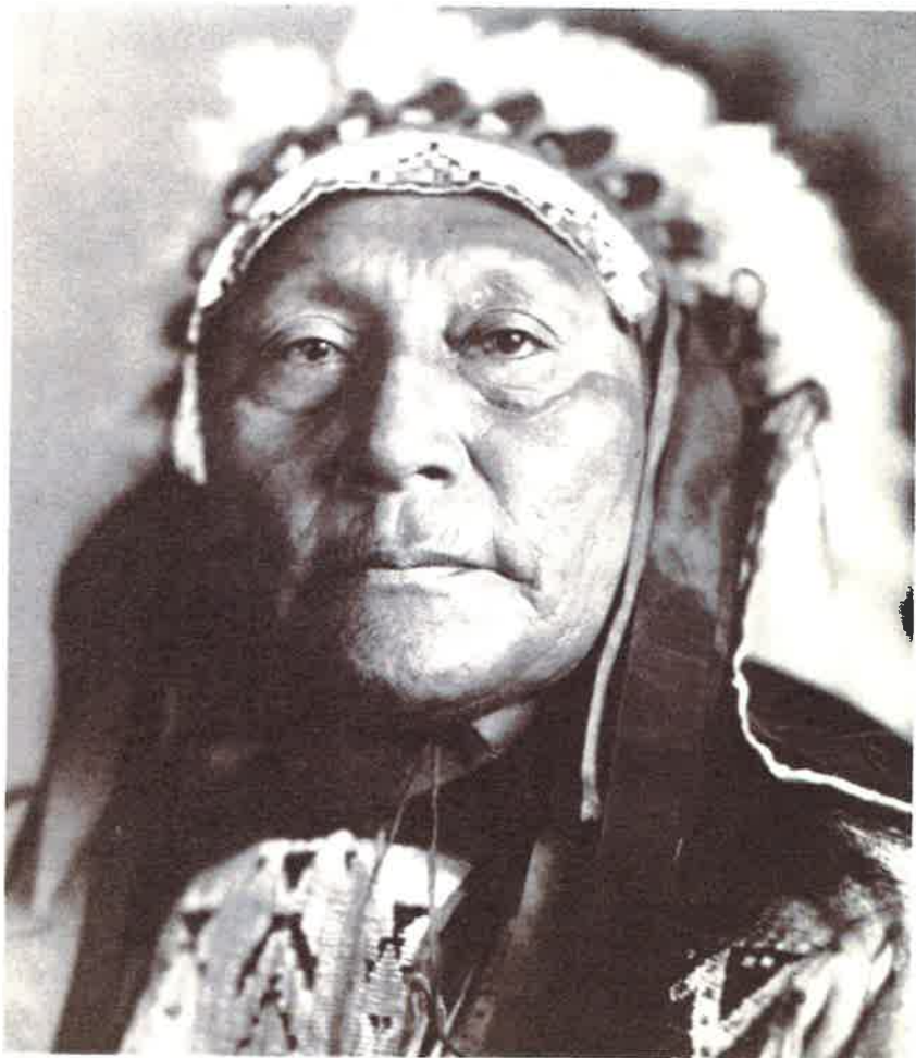
BUREAU OF CATHOLIC INDIAN MISSIONS

7. But persons are vitally dependent upon the institutions of family and community that have been passed down to them. These institutions—political, social, economic and religious—shape their self-understanding and are necessary to their full development as persons. Indeed, the Second Vatican Council affirmed that persons can come to an authentic and full humanity only through those distinct cultures